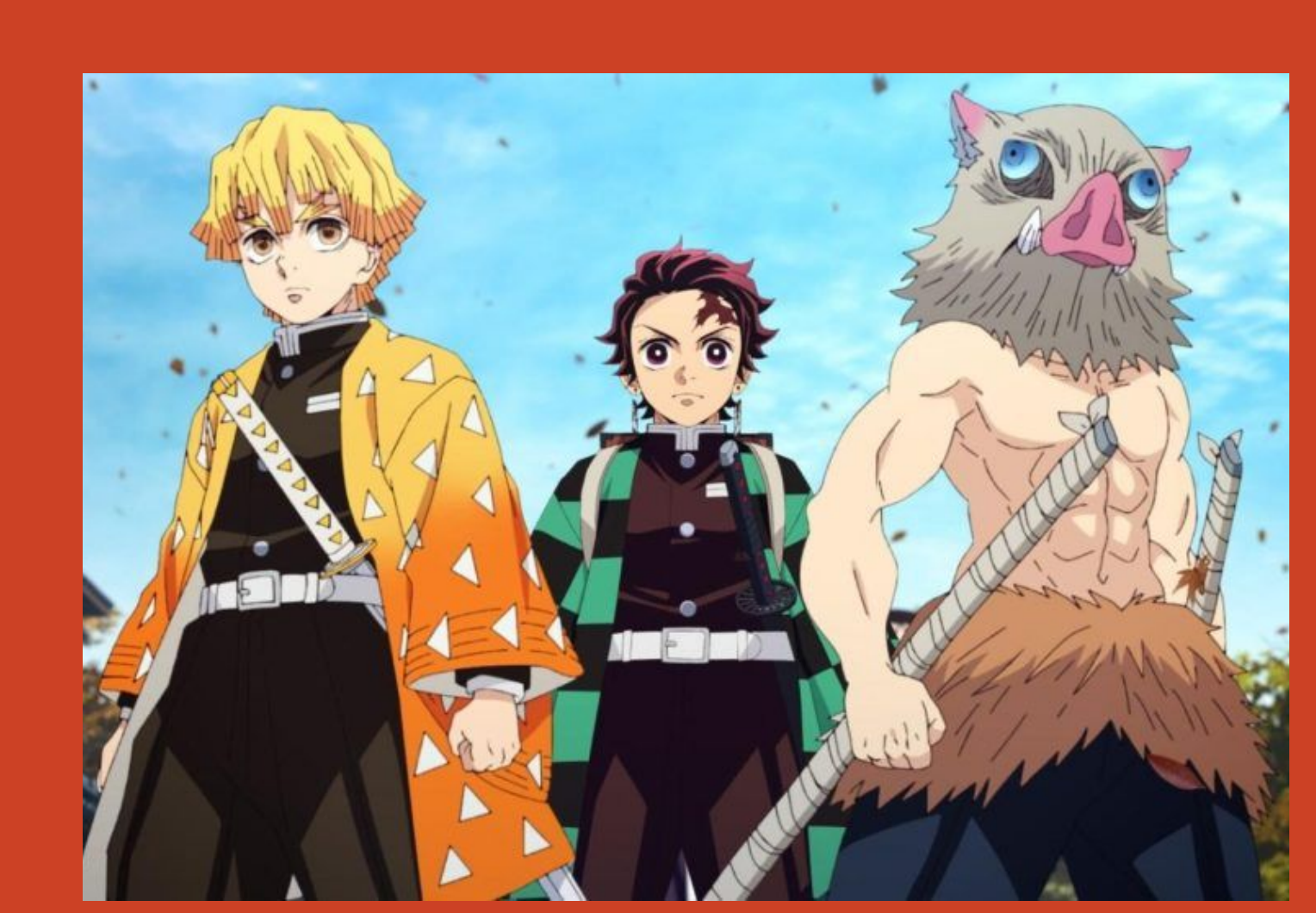
Reanimate lip movements in dubbed anime