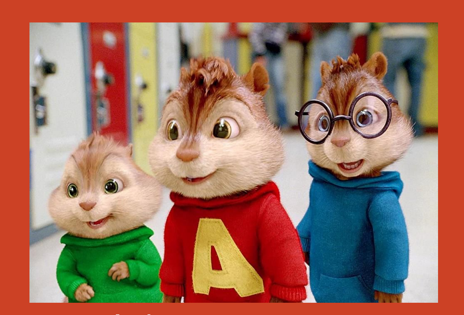
Animate computer generated character models