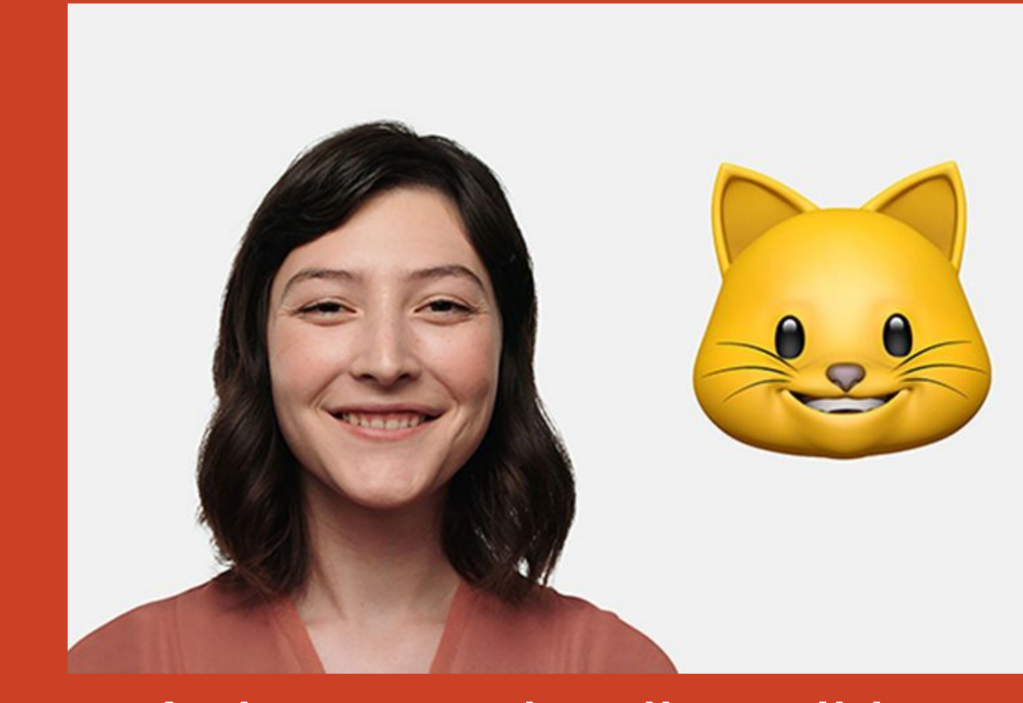
Animate animojis, talking heads, and face filters