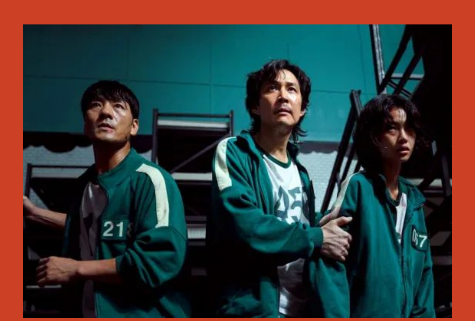
Reanimate lip movements in dubbed live action films